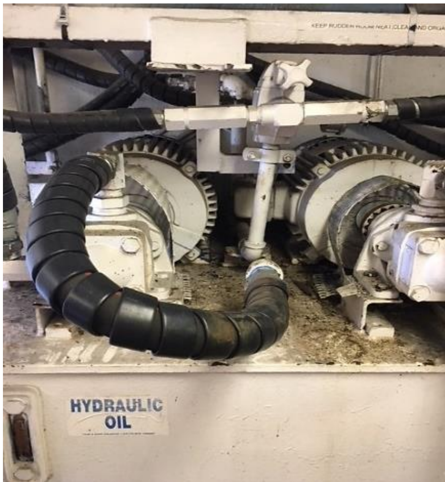
Steering hydraulic pump motors that operated the flanking and main rudders.

discharge side of the pump, preventing adequate oil flow from reaching the hydraulic pistons and developing the required pressure to move the rams.