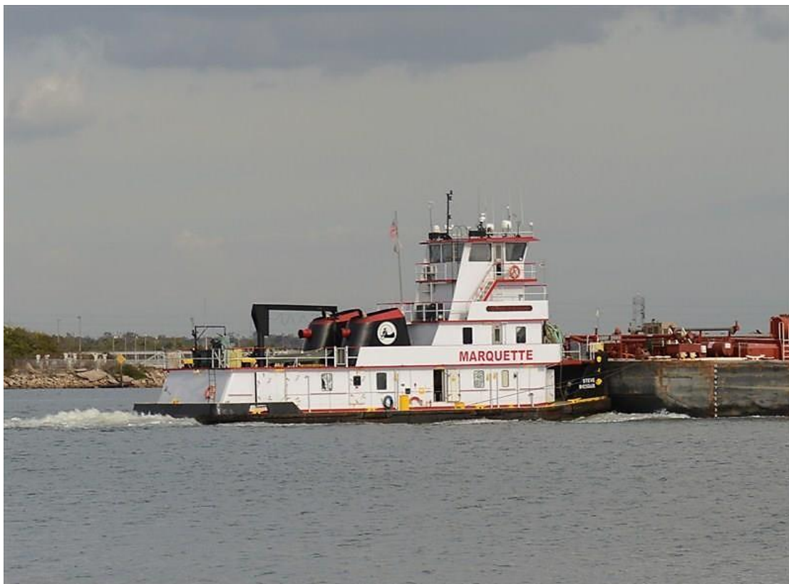
Steve Richoux under way before the accident.

On May 7, 2018, about 1848 local time, the towing vessel Steve Richoux with five crewmembers was downbound on the Mississippi River in New Orleans, Louisiana, pushing six loaded cement barges when a steering system failure occurred. The pilot and the captain tried to regain steering control of the vessel. Despite their efforts, the Steve Richoux struck the Mardi Gras World pier at mile 98. No pollution or injuries were reported; estimated property damage exceeded $3 million.