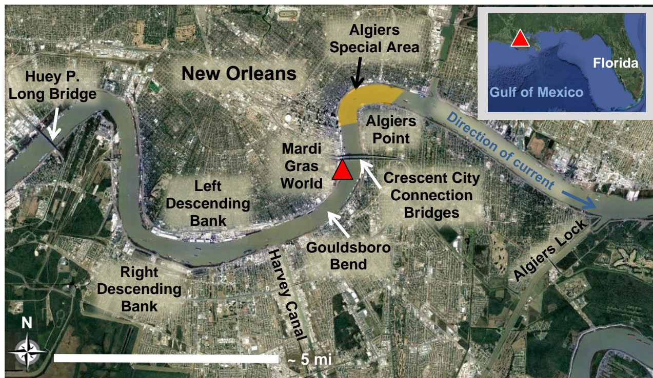
Satellite image of the Mississippi River in New Orleans. The accident site at Mardi Gras World is shown in the center of the image, overlaid with a red triangle.

The Steve Richoux , a twin-propeller towing vessel, was powered by two Caterpillar 3508 diesel engines capable of producing 1,800 horsepower. The vessel was built in 1976 by Calumet Shipbuilding Company in Morgan City, Louisiana. It was owned by Marquette Transportation and homeported in New Orleans.