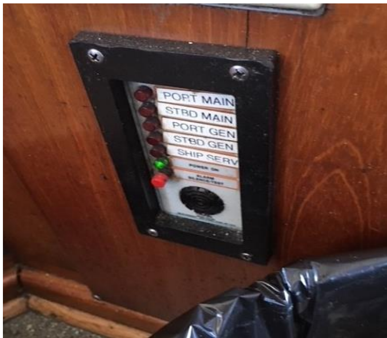
Alarm panel located on the starboard side of the wheelhouse near the deck. The alarm labeled “SHIP SERV” indicated that the steering system was over-pressurized.

The system was designed so that, if over-pressure occurred, a hydraulic pressure relief valve would lift, protecting the fittings, piping, hoses, and pumps. The “SHIP SERV” alarm would also sound and illuminate in the wheelhouse. The service technician told investigators that this alarm indicated high hydraulic system pressure.