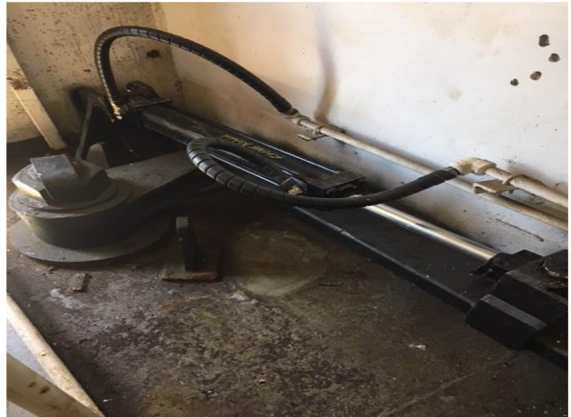
Left, the port flanking rudder steering hydraulic ram that was removed after the incident. Right, the port flanking rudder steering system with the original steering ram in place.

The system was designed so that, if over-pressure occurred, a hydraulic pressure relief valve would lift, protecting the fittings, piping, hoses, and pumps. The “SHIP SERV” alarm would also sound and illuminate in the wheelhouse. The service technician told investigators that this alarm indicated high hydraulic system pressure.